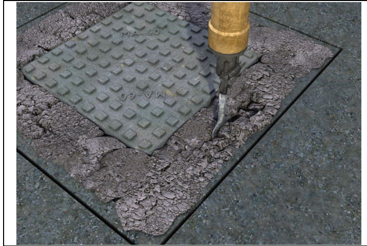
Figure 2 Excavating failed ironwork

4.3.4.6 All old bedding mortar is removed and the supporting structure cut back, or loose bricks removed until a sound base is achieved.