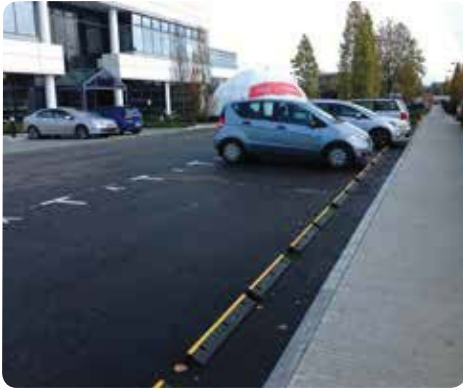
Car Park, Guildford