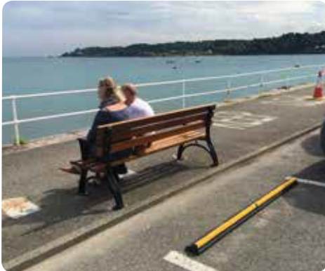
Car Park, Jersey