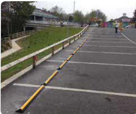
Retail Park, Bridlington