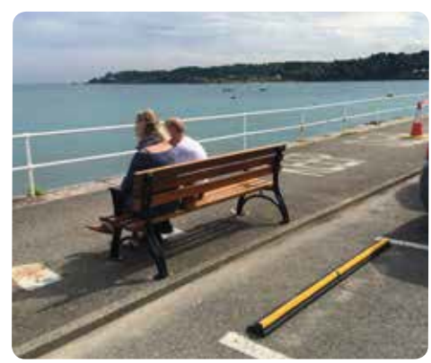
Car Park, Jersey