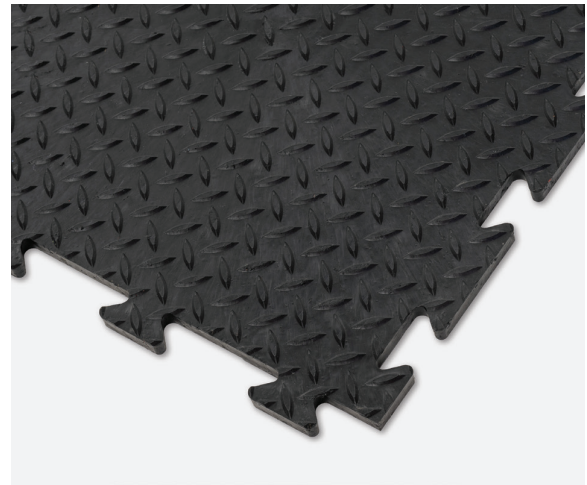
Black in stock, other colours available on request. Bevels available in both black and yellow