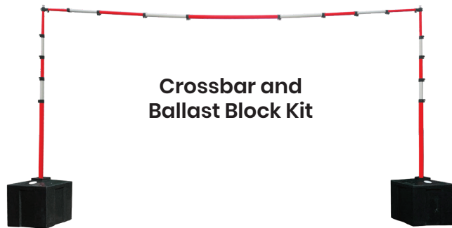
Crossbar and Ballast Block Kit