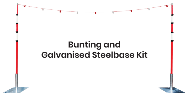
Bunting and Galvanised Steelbase Kit