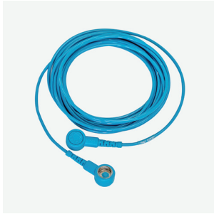
Common Grounding Point Cord - Socket