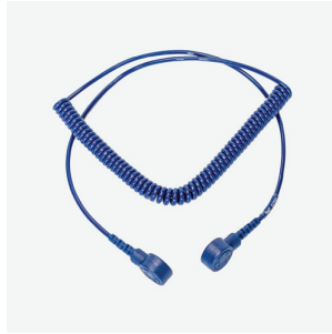
Coiled Earth Lead - 10mm to 10mm Stud