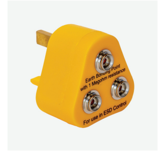
Earth Bonding Plug