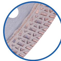
DP16820 - DP16845