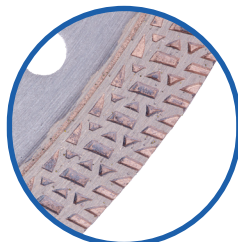
DP16850 & DP16851 only