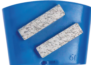
MEDIUM/ 60 GRIT