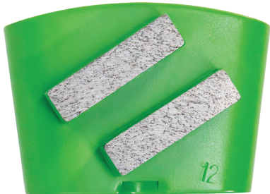
FINE/ 100 GRIT