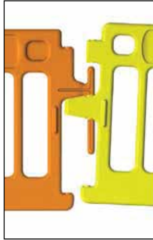
LIFT ONE BARRIER TO LOCK