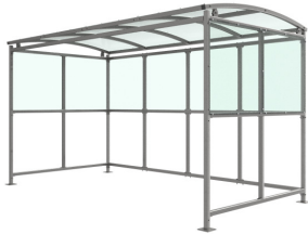
138 000 553 – 2x4 Brandon Shelter