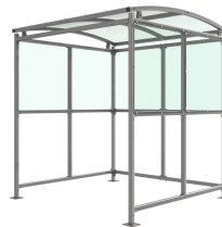
138 000 551 – 2x2 Brandon Shelter