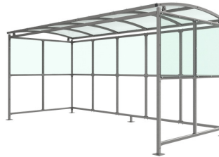
138 000 554 – 2x5 Brandon Shelter