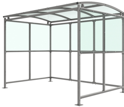
138 000 552 – 2x3 Brandon Shelter

The Brandon shelter is a free-standing, open sided shelter designed for on site assembly, constructed from galvanised mild steel. Complete with a 4mm UV stabilised PETG clear sheet roof, and ½ side panels. Side-to-side curved roof.