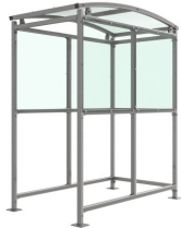
138 000 550 – 2x1 Brandon Shelter