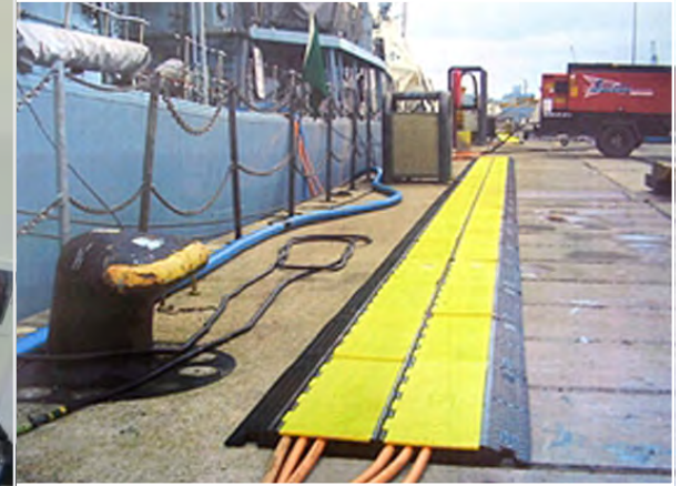
PICTURED: YJ5-125 IN USE)

Checkers' Linebacker Cable Management offers the most extensive line of high performance cable/hose protection products in the world. These durable cable protection systems provide a safer method of passage for pedestrian traffic, vehicles and heavy duty equipment while protecting valuable electrical cables, cords and hose lines from damage.