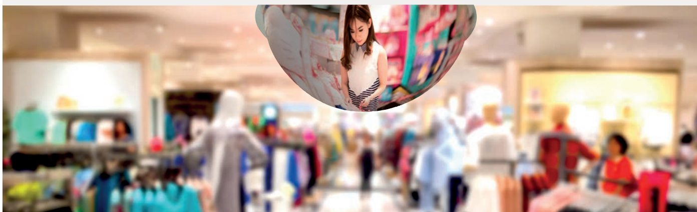
Above: ref. 3645, Ø 450 mm