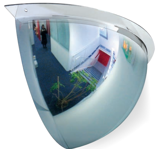
1/8 sphere corner mirror