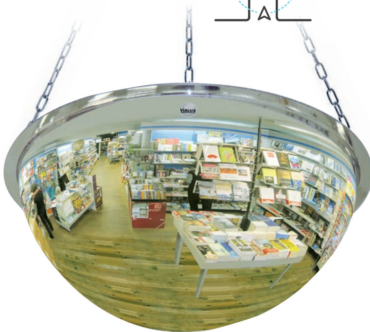
1/2 sphere mirror