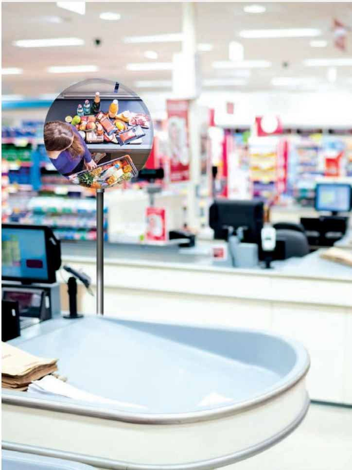
Above: ref. 108, Ø 800 mm