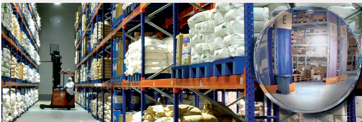
Above: ref. 56-80, Ø 800 mm