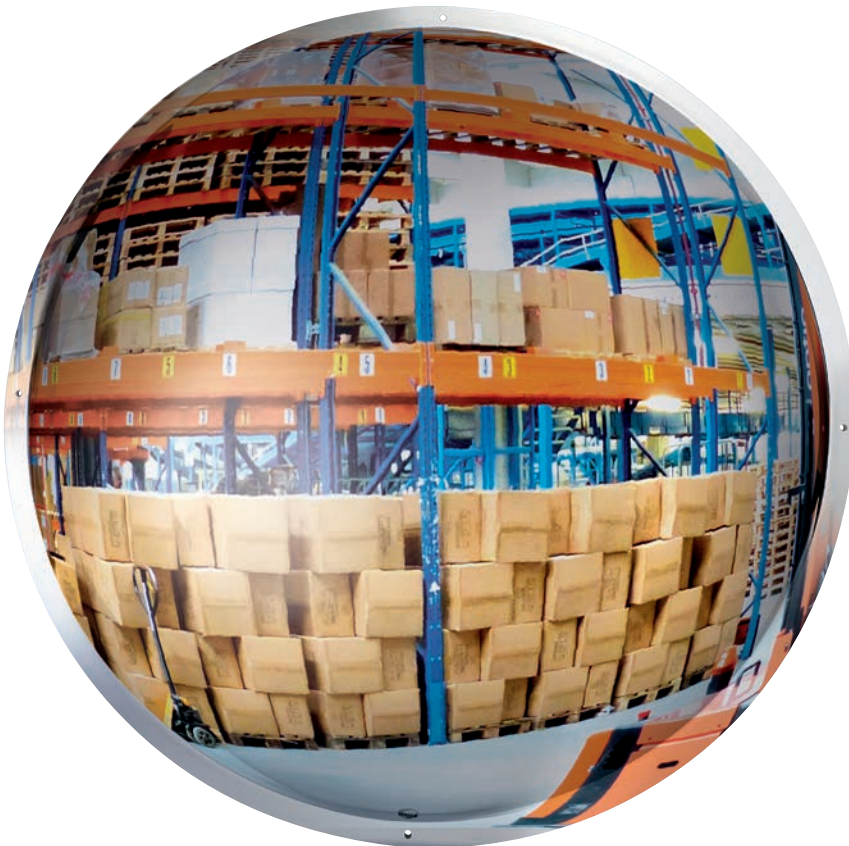
Above: vertical 1/2 sphere in Polymir®