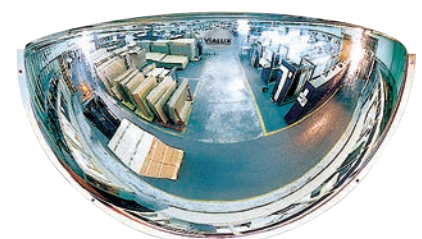
Above: PMMA 1/4 sphere