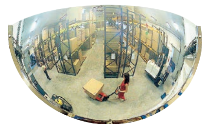
Above: polymir® 1/4 sphere