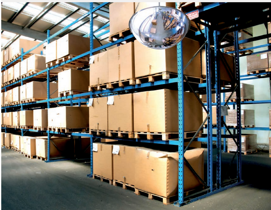
Above: ref. 3680, Ø 800 mm