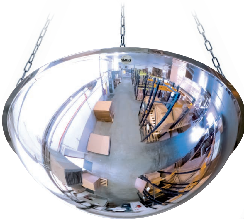
Above: horizontal 1/2 sphere mirror in PMMA