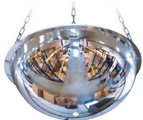
Above: horizontal 1/2 sphere mirror in polycarbonate with central drainage hole.