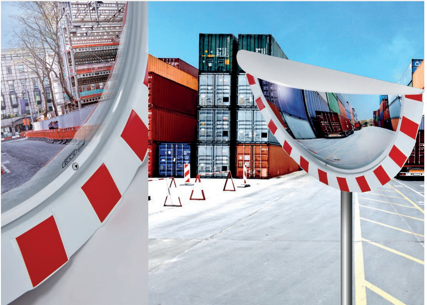
Above: ref. 9180, 800 x 400 mm