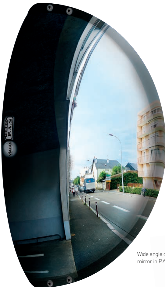
Wide angle driveway mirror in P.A.S.®