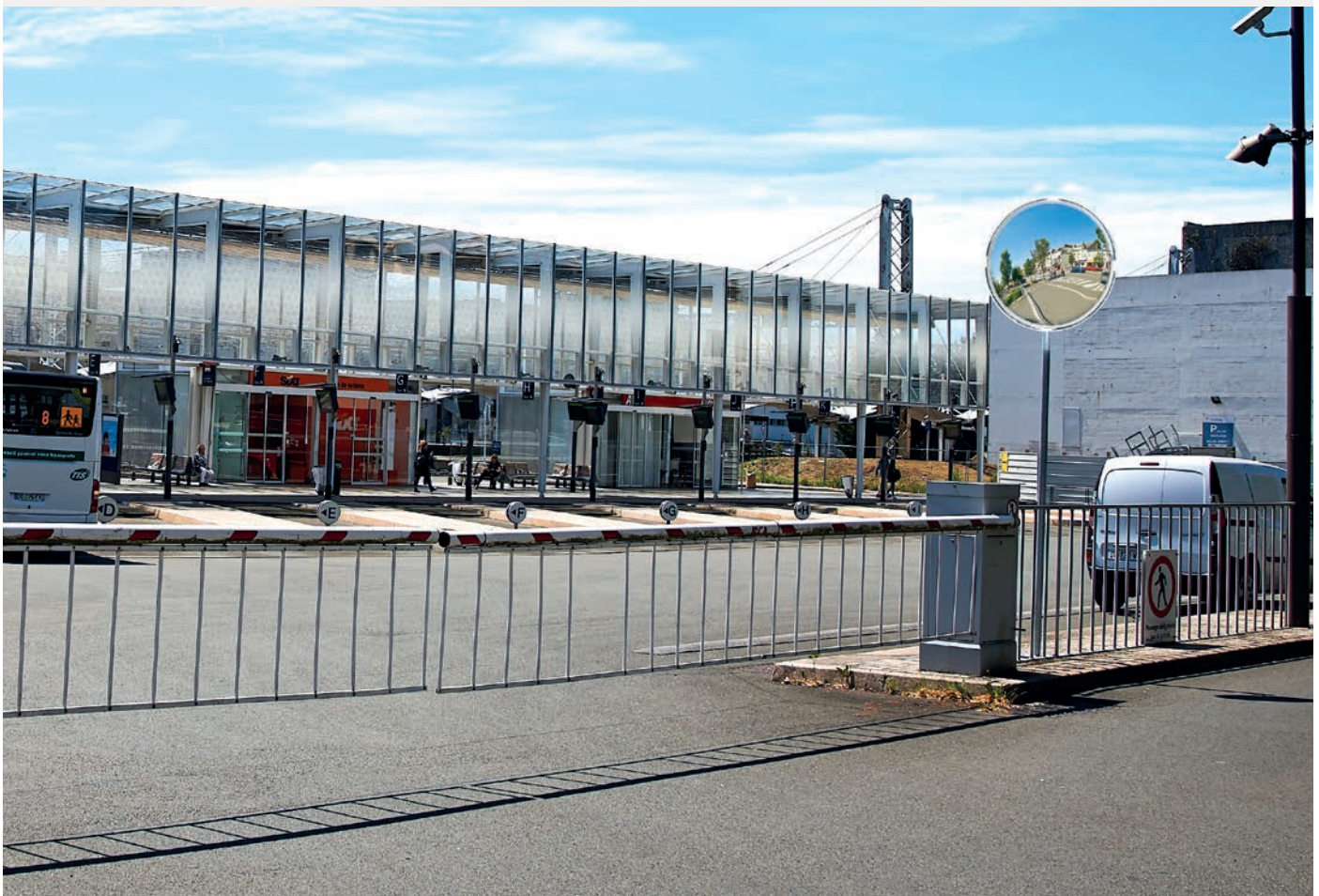
Above: ref. 9080, Ø 800 mm