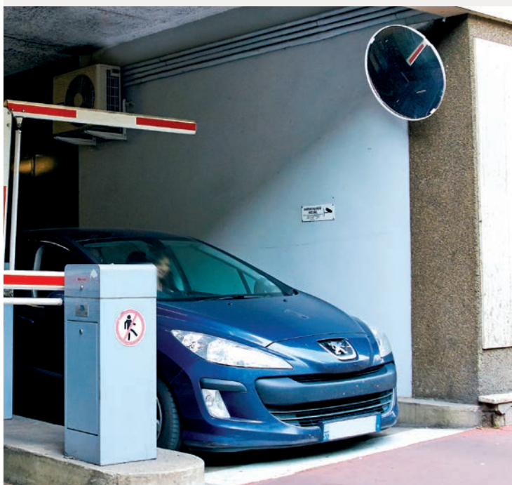
Above: ref 916, Ø 600 mm