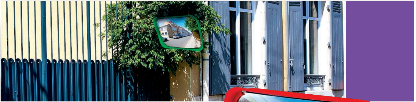
Above: ref V926, 600 x 400 mm