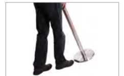
Roller base for fast, easy moving