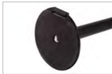
Full coverage rubber floor protector