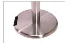
Discrete 4.5" / 115mm roller for moving stability