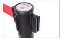
Universal belt end connects to all major brands