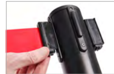
Belt lock to prevent accidental belt release