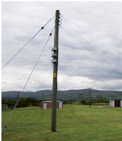
Figure 3 400 V distribution line

7 Most high-voltage overhead lines, ie greater than 1000 V (1000 V = 1 kV) have wires that are bare and uninsulated but some have wires with a light plastic covering or coating. All high-voltage lines should be treated as though they are uninsulated. While many low-voltage overhead lines (ie less than 1 kV) have bare uninsulated wires, some have wires covered with insulating material. However, this insulation can sometimes be in poor condition or, with some older lines, it may not act as effective insulation; in these cases you should treat the line in the same way as an uninsulated line. If in any doubt, you should take a precautionary approach and consult the owner of the line.