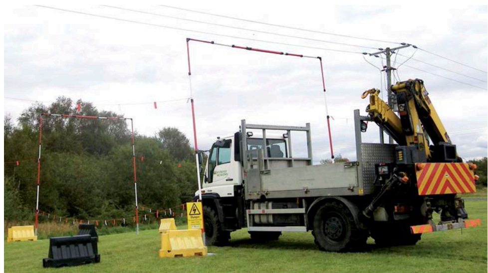
Figure 5 Typical passageway through barriers