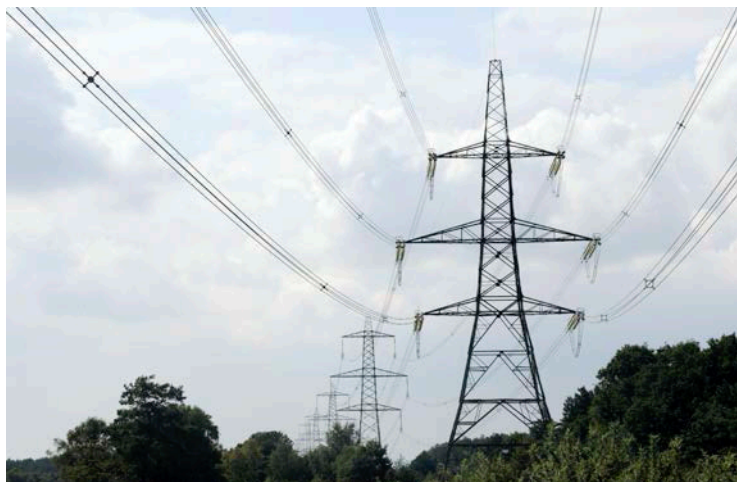
Figure 1 275 kV transmission line

6 Most overhead lines have wires supported on metal towers/pylons or wooden poles – they are often called ‘transmission lines’ or ‘distribution lines’. Some examples are shown in Figures 1–3.