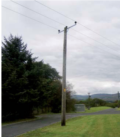
Figure 2 11 kV distribution line