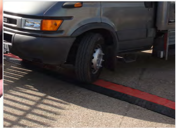
PICTURED: GD5X125 IN USE

Checkers' Linebacker Cable Management offers the most extensive line of high performance cable/hose protection products in the world. These durable cable protection systems provide a safer method of passage for pedestrian traffic, vehicles and heavy duty equipment while protecting valuable electrical cables, cords and hose lines from damage.