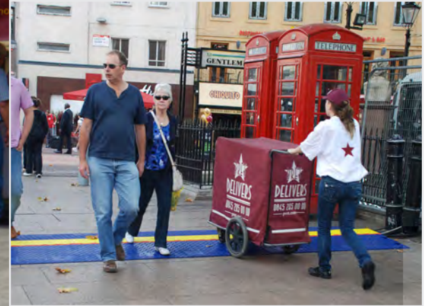
PICTURED: GD5X125-ADA IN USE (LEFT) HEAVY DUTY ACCESSIBILITY RAMPS IN USE (TOP)

Checkers' Linebacker Cable Management offers the most extensive line of high performance cable/hose protection products in the world. These durable cable protection systems provide a safer method of passage for pedestrian traffic, vehicles and heavy duty equipment while protecting valuable electrical cables, cords and hose lines from damage.