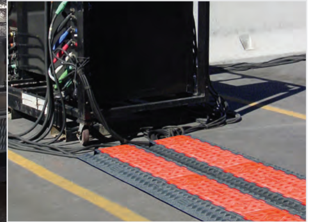
PICTURED: GD5X125 IN USE (TOP) GD3X225 IN USE (LEFT)

Checkers' Linebacker Cable Management offers the most extensive line of high performance cable/hose protection products in the world. These durable cable protection systems provide a safer method of passage for pedestrian traffic, vehicles and heavy duty equipment while protecting valuable electrical cables, cords and hose lines from damage.