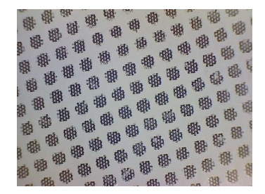
Figure 1 - Sheeting is positioned at 0° orientation

The Flexible Engineer Grade Prismatic sheeting is differentiated from other prismatic or encapsulated lens sheeting by the distinctive surface pattern and the visible integral marking.